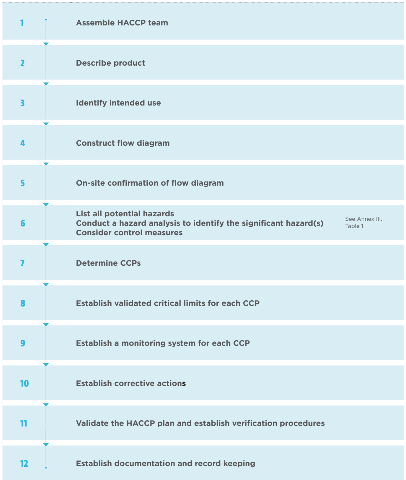
Figure 1 Logic sequence for application of HACCP