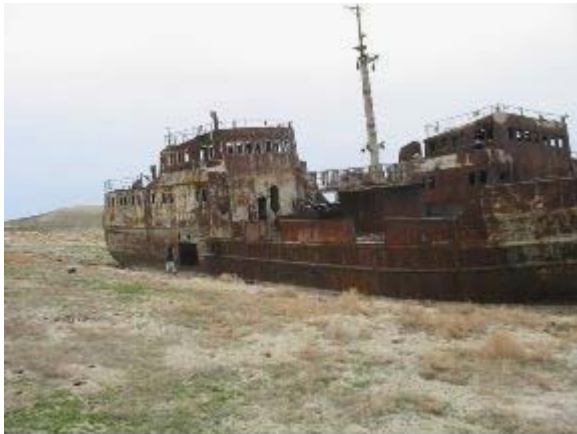
Orphaned Ship in the Aral Sea

Q: What countries do you put at the top of your list for adequate, clean water supplies and an understanding of the proper way to handle such a valuable resource? Which countries are at the bottom and can be expected to suffer a water crisis in the near future?