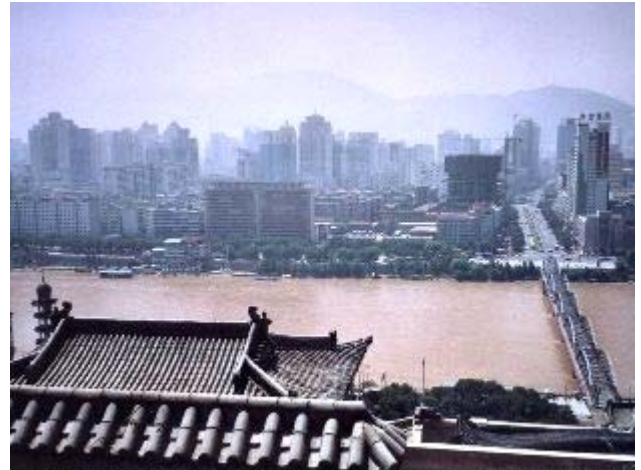
Yellow River Cuts Through Lanzhou

FP: For thousands of years, the Chinese have controlled the Yellow River as it crosses its floodplain on its last several hundred miles' journey to the sea, by constraining it within artificial banks, levees. The idea is to prevent floods. But the river is the world's siltiest and through time it deposits this silt on its channel bed, which rises higher and higher above the surrounding floodplain. The Chinese have kept the river on its course by raising the levees ever higher. Hence the term “hanging river”. But this is a “double-or-quits” strategy. Chinese history is peppered with disasters when the river breaks its levees and floods across the land.